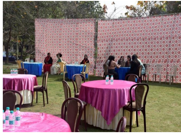
Lunch by the Guests in natural environment