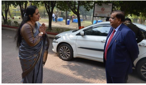
Welcoming the Guests