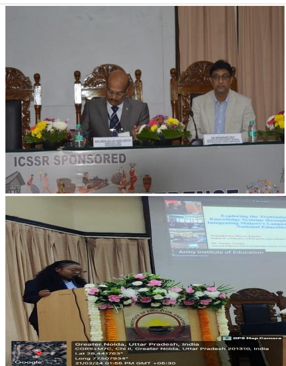
Paper Presentations in Technical Session III