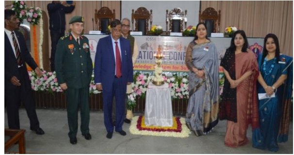
Glimpses of Lamp Lighting