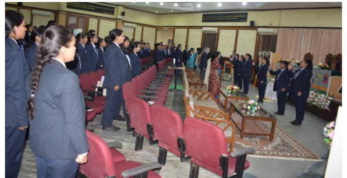
Group Photographs and the ISL National Anthem