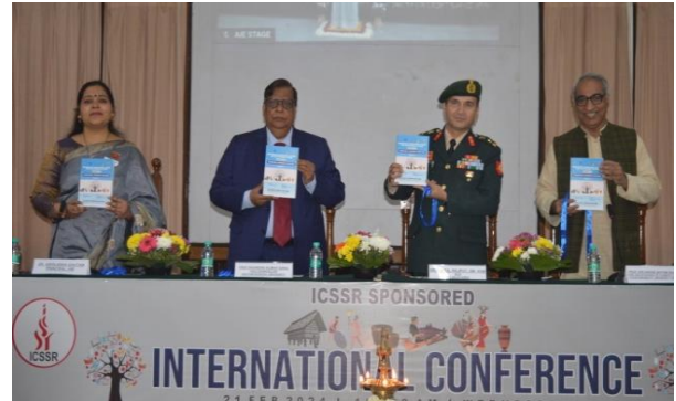
Felicitation of Guests and Releasing of Proceeding