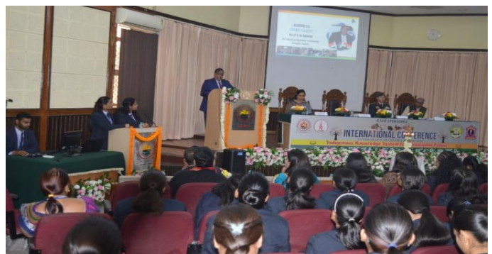
Address by Chief Guest