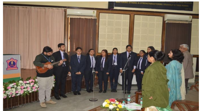
Vote of Thanks and National Song